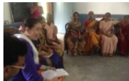
Teacher Training Workshops