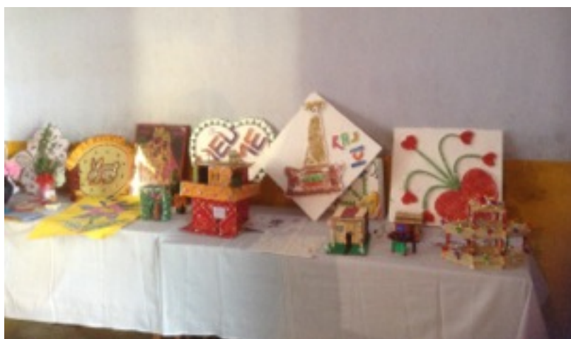
Some of the incredible artwork created by PV School students