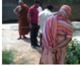
BREAKING GROUND P.1