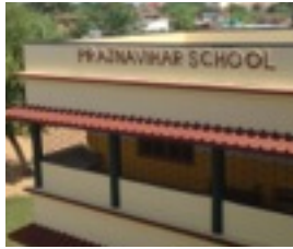
APRIL/MAY 2014 NEWSLETTER