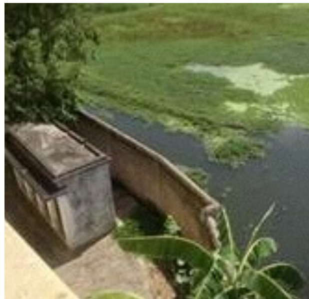
These four toilets serve 530 children. We plan to add 20 urinals, 10 for boys and 10 for girls