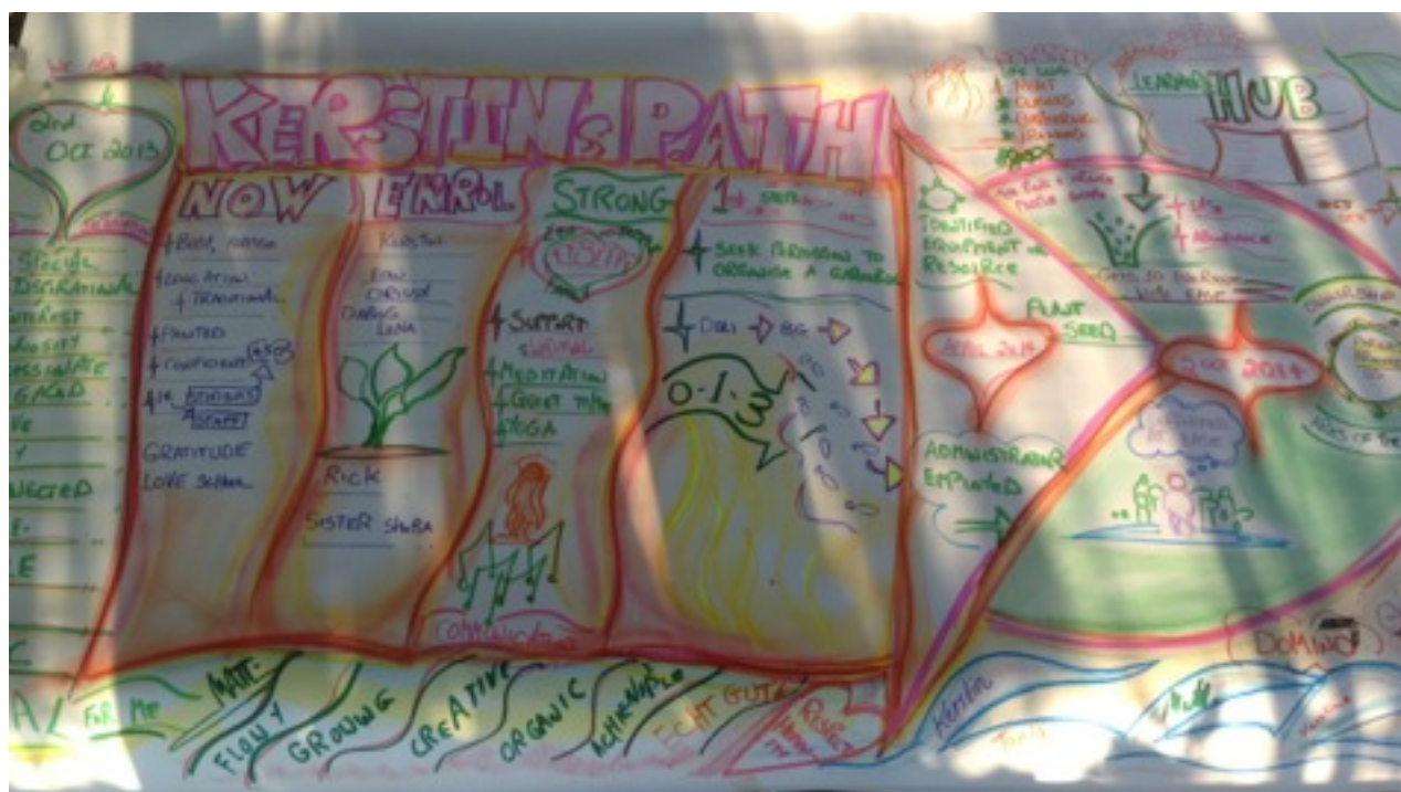
PATH picture drawing

Once we arrived in Bodhgaya, Rick and I went to the school regularly, attended and initiated countless meetings and were involved in many of the nitty-gritty organisational things relating to the running of the school.