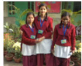
TOUR TO CALCUTTA P.7