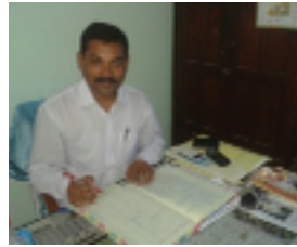
FINANCIAL SUPPORT P.5