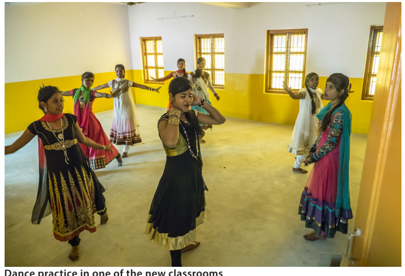
Dance practice in one of the new classrooms