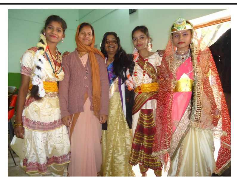
PV students backstage