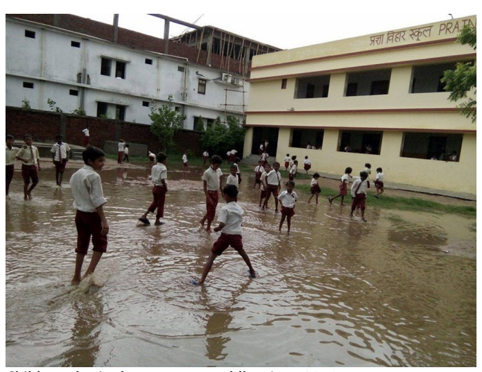
Children play in the monsoon puddles: June 2016