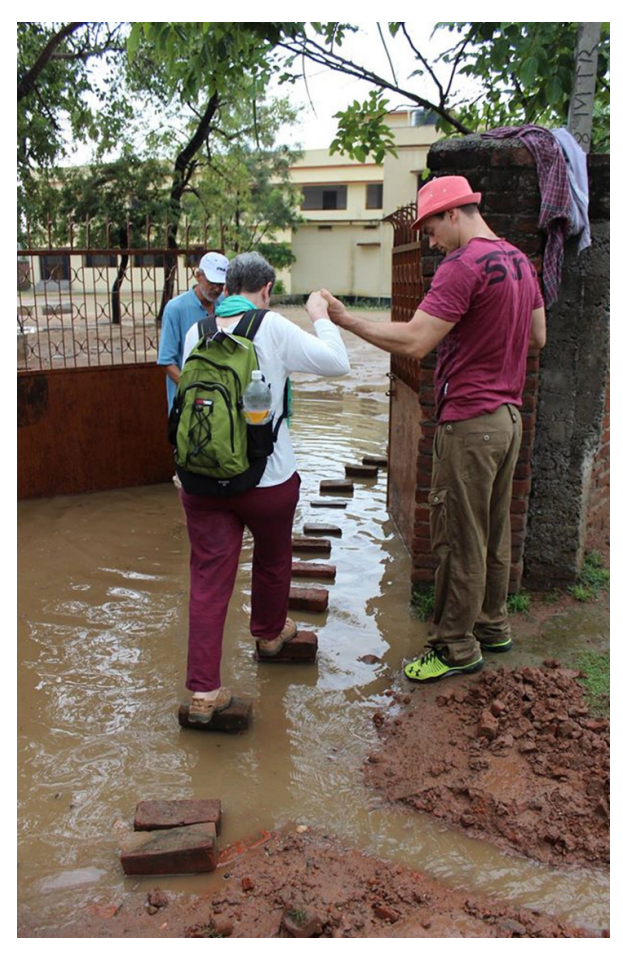
September, 2015: Australian friends struggle to stay dry while coming to the school in monsoon

On August 15, 1947, India won its Independence from the British. In the photo above, our students are re-enacting a famous statue of freedom fighters.