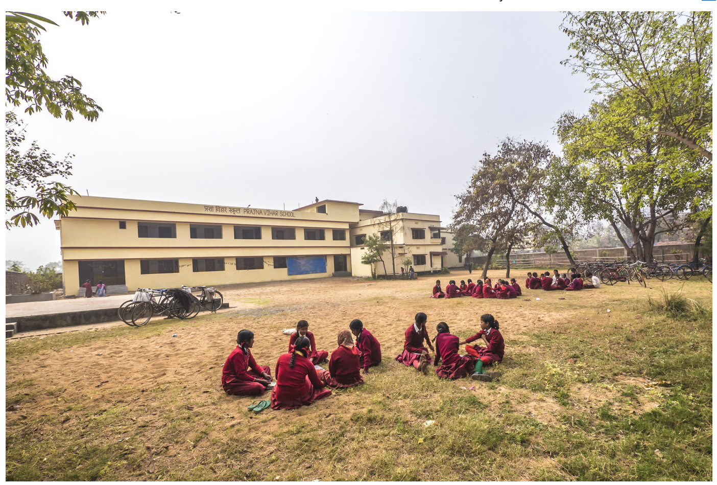
Our newly constructed wing is on the left