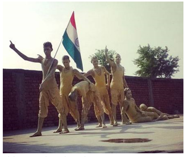
Celebrating Independence day: August 2015

On August 15, 1947, India won its Independence from the British. In the photo above, our students are re-enacting a famous statue of freedom fighters.