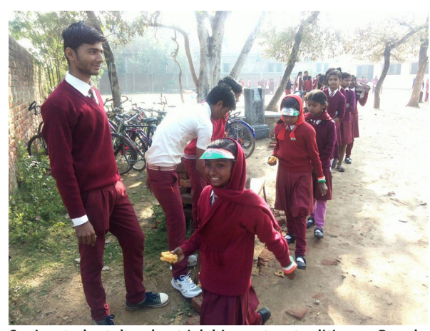
Senior students hand out Jalebi sweets, a tradition on Republic Day.