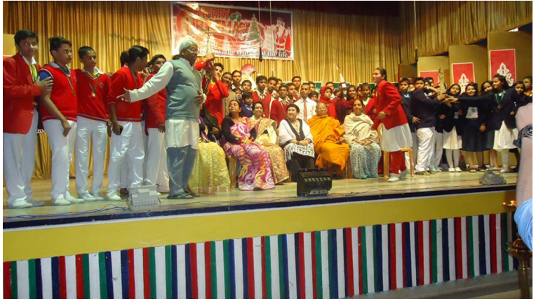
Group photo with all 3 winning schools

In December 2015, our children participated in a SKIT competition which was organized by the Inter-Religious Friends' Associational one of the top schools in Gaya. Our PVS students' skit of "Victory over violence, the Story of Lord Buddha with Angulimala" was much appreciated and they came in third place.