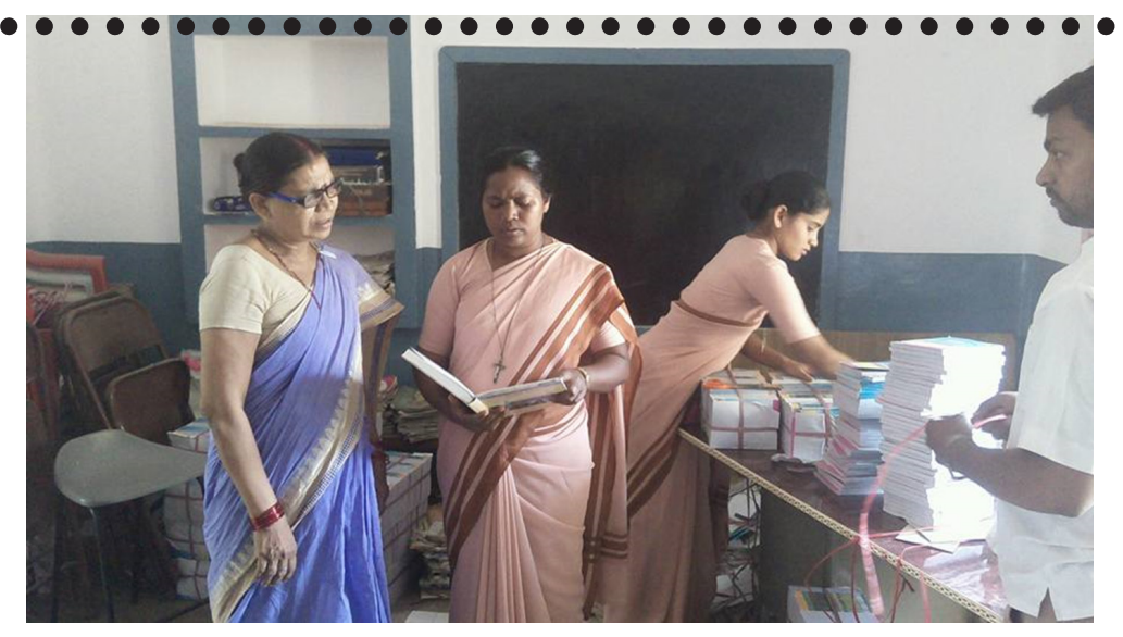
Preparations for the distribution of books are underway: June 2016. Students of the PVS receive books free of cost for each of the offered subjects.