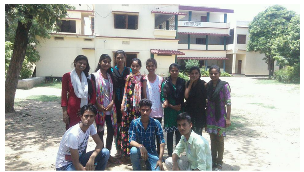
Our Class 10 students: March, 2016