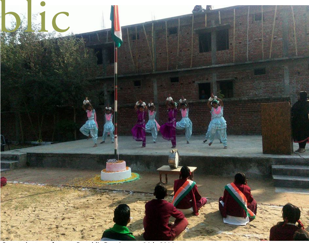
on Republic Day, January 26th, 2016