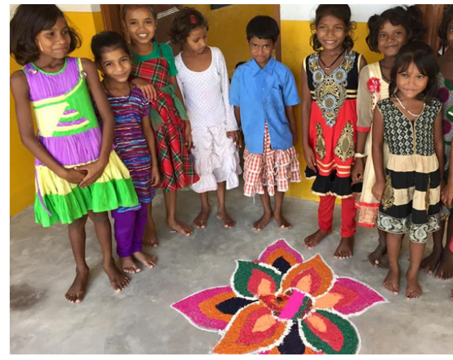
Students share their rangoli, a colored rice powder design traditionally made outside front doors during festival time.