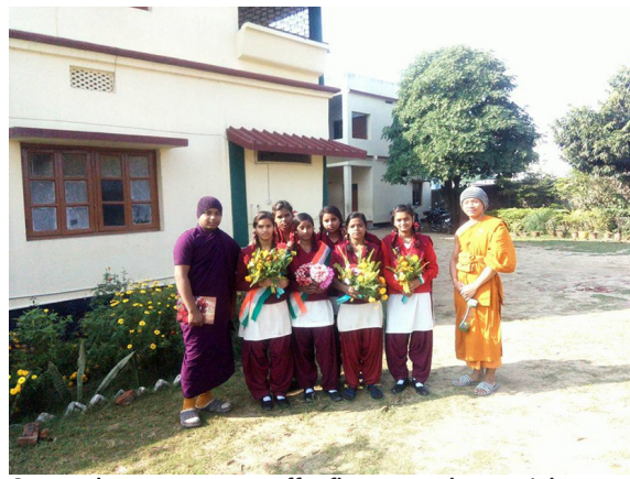
Our students prepare to offer flowers to the special guests